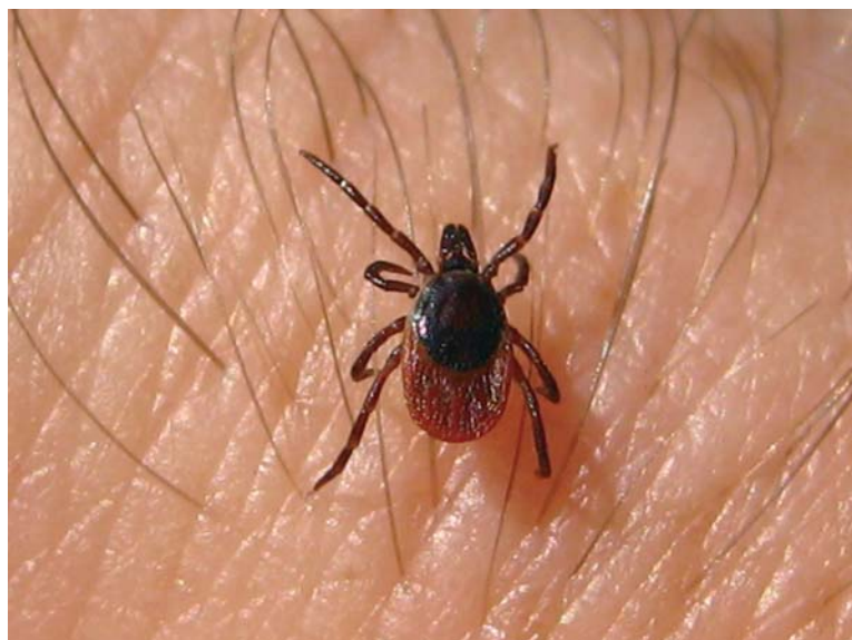
Figure 4 right Ixodes ricinus adult walking across the upper surface of a finger. The flaccid abdomen (red-brown) and the mouthparts are clearly visible. The hypostome is protected by two lateral palps.