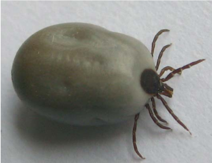
Figure 5. Ixodes ricinus adult engorged with blood after feeding on a pet dog. In this state the tick resembles a coffee bean. The hypostome is visible between the two palps, and has been slightly damaged during removal of the tick.

Strle 2003, Dennis and Hayes 2002). Among groups most at risk of infection are forestry workers, wildlife managers, gamekeepers, outdoor educators, hikers, military field personnel, rural residents and visitors to focal regions (Lindgren and Jaenson 2006, Guerra et al. 2002). In England and Wales, the highest number of reported cases are in the 25-44 and 45-64 age groups, reflecting the age range of most visitors to areas where infected ticks are endemic (HPA 2009). In Scotland, the peak age group for infection is 60-64 years in both sexes (HPS 2009a). This is likely a reflection of greater exposure among the newly retired age groups. Children are however vulnerable due to their small stature, typical play activities and lack of awareness (Chin 2000, CDC 2002).