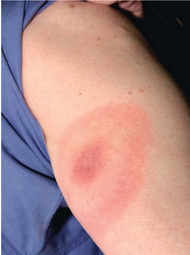
Figure 6 Characteristic "bull's eye" erythema migrans lesion on the posterior right upper arm of a woman diagnosed with Lyme disease. This is a dramatic presentation of the lesion, which appears in different shapes and forms dependent on the location of the bite. This picture was taken in the US; in Europe the erythema migrans lesions tends to be less intensely coloured and to have a longer duration.

and Strle 2003, Wormser 2006). It is important to note that erythema migrans is absent in approximately 20 percent of cases in North America and a higher proportion of those in Europe (Steere et al. 2004).